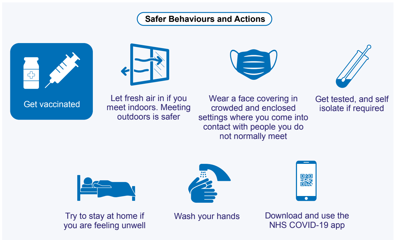
Figure 2: Safer Behaviours and Actions